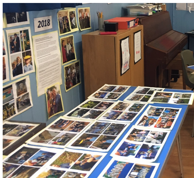
Digital colour photos mark the transition to more modern school days.