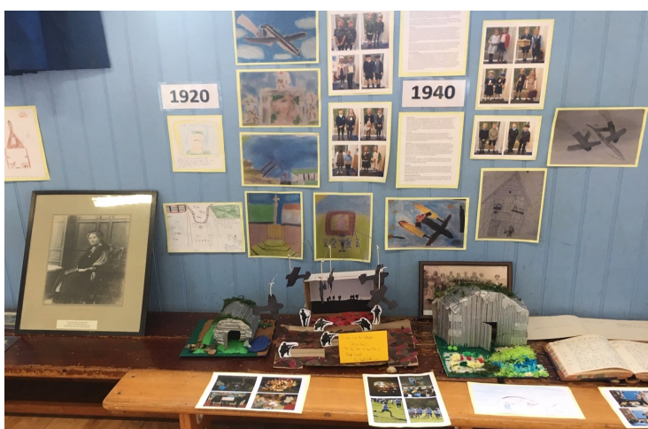
One part of the 200 year timeline.