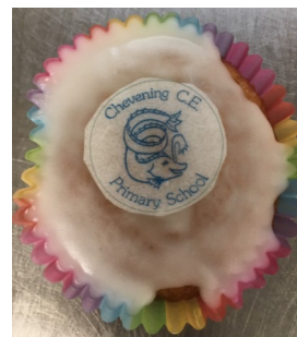
Thank you to the bakers for the beautiful school cakes!