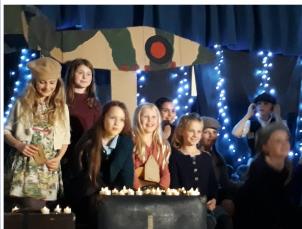
Performing Arts' Spitfire Nativity