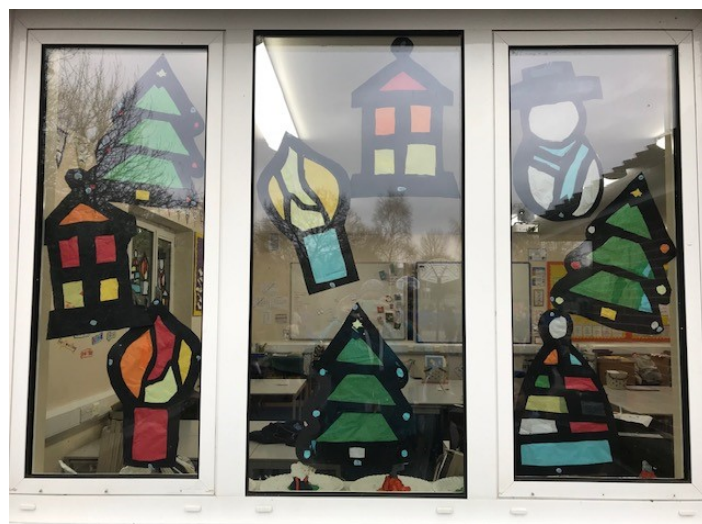
Y3's stained glass windows