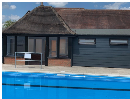
Refurbished changing room block