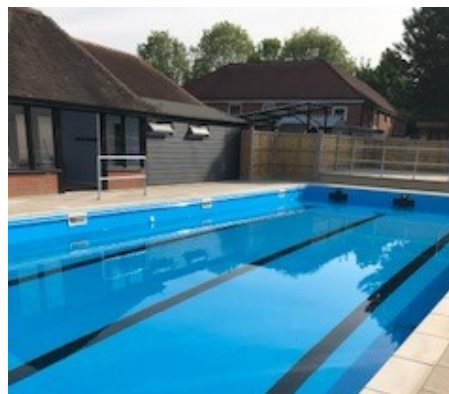
New pool liner