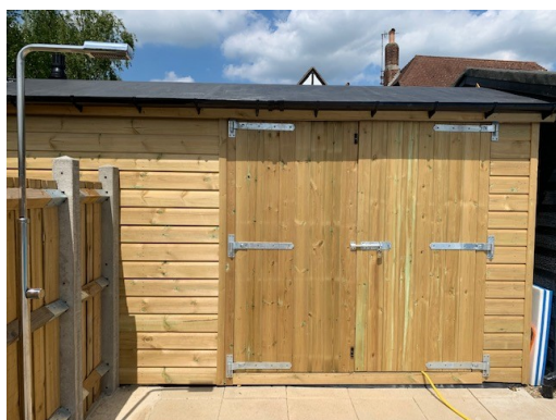
New building - Hosts the new pool equipment, boiler and electrics.

We are pleased to be able to share with you some of the many parts of the swimming pool refurbishment project that is nearing completion. The children will enjoy their first swim on Tuesday, 4th June. Don't forget to "Sponsor A Fish" as more panels will be added as the donations grow. Please continue to watch out for details of the Grand Opening on 17th June.