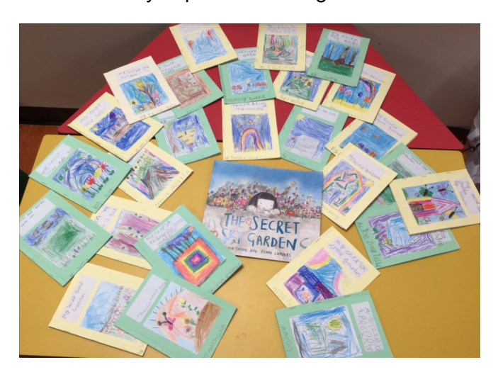
For further details on your child's learning, have a look at their class page on the school website.