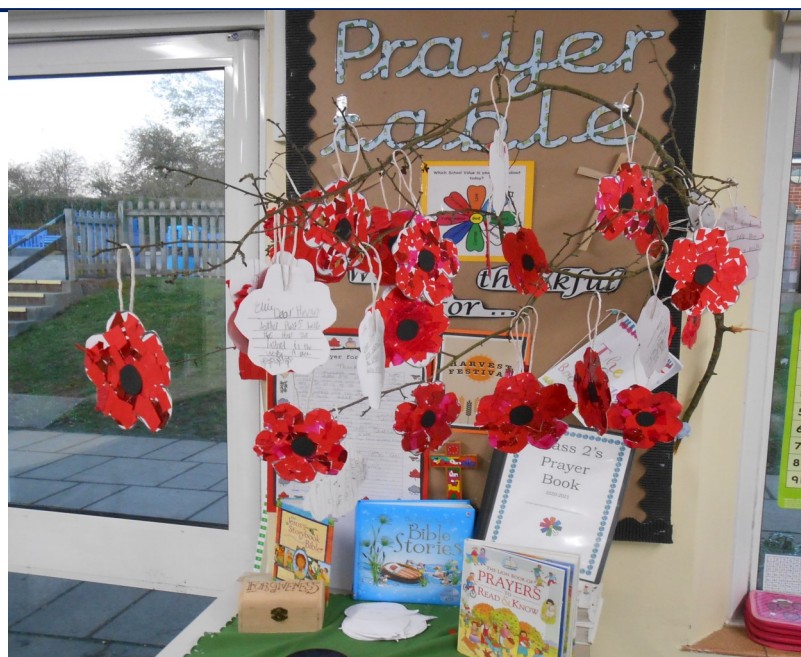
Class 2 have hung their hand-made poppies on their Class Prayer Tree