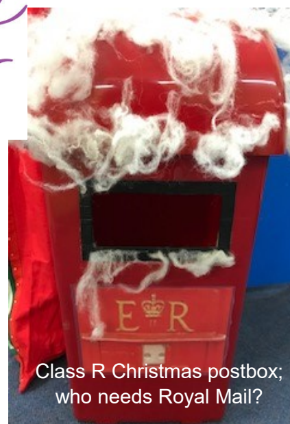
Class R Christmas postbox; who needs Royal Mail?

Click on the image for a link to a family Advent Calendar that lasts to Epiphany.