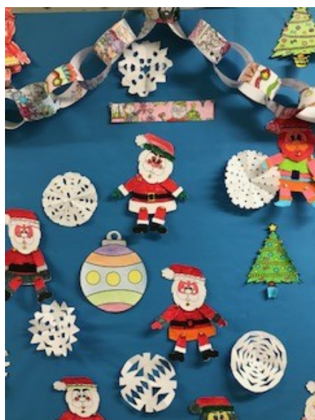
EMC's Christmas Craft