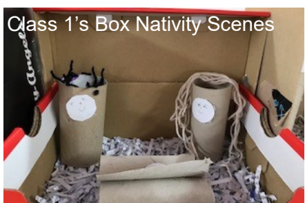
Class 1's Box Nativity Scenes