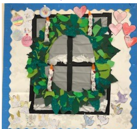
Class 3's Advent display