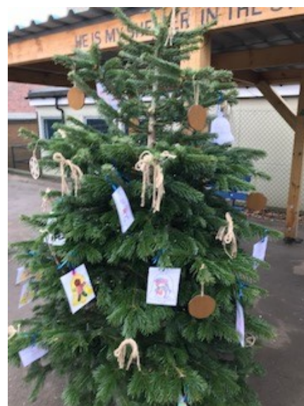
The second PTFA decorated Christmas tree—lovely colouring competition decorations!