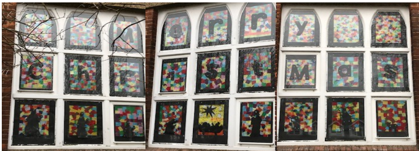
A 'close-up' of our whole-school message to everyone walking/driving/living on Chevening Road!