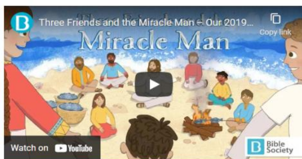
Three Friends and the Miracle Man

Please click on the images below for Easter activities and online clips to enjoy with your family.