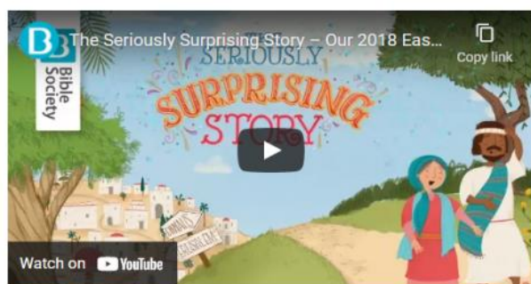
The Seriously Surprising Story

There are a number of live & on-line Easter opportunities at St Botolph's . Click on the image for more details.