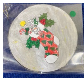
Abi F—Class 5