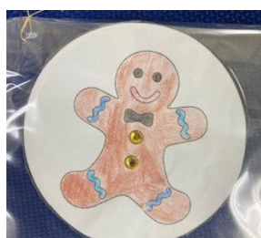
Poppy O—Class 6