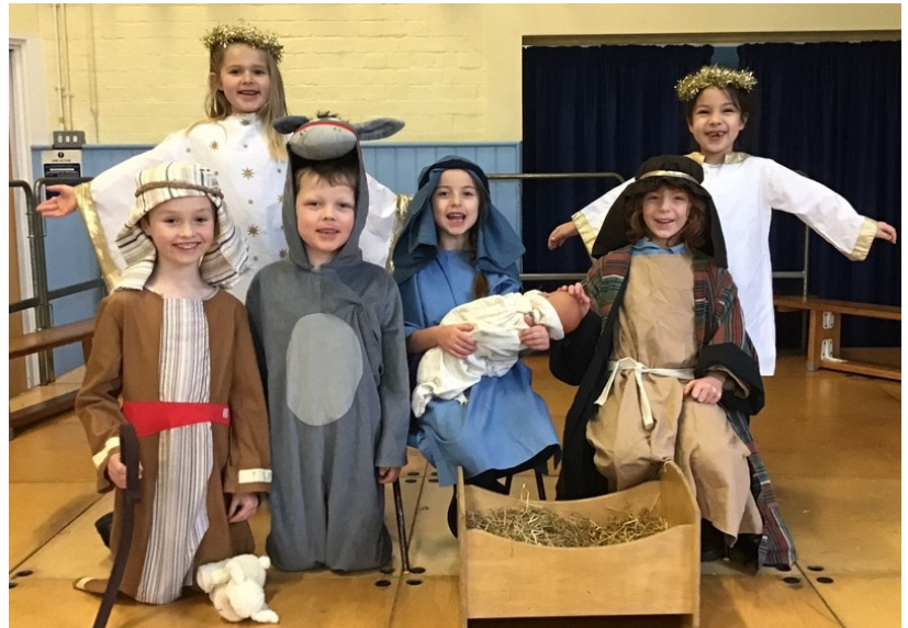
Key Stage 1 Nativity rehearsals are underway!