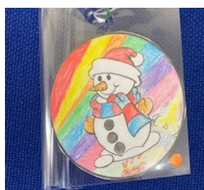
Theo F—Class 4