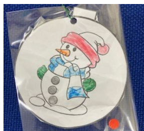
Lottie —Class 1